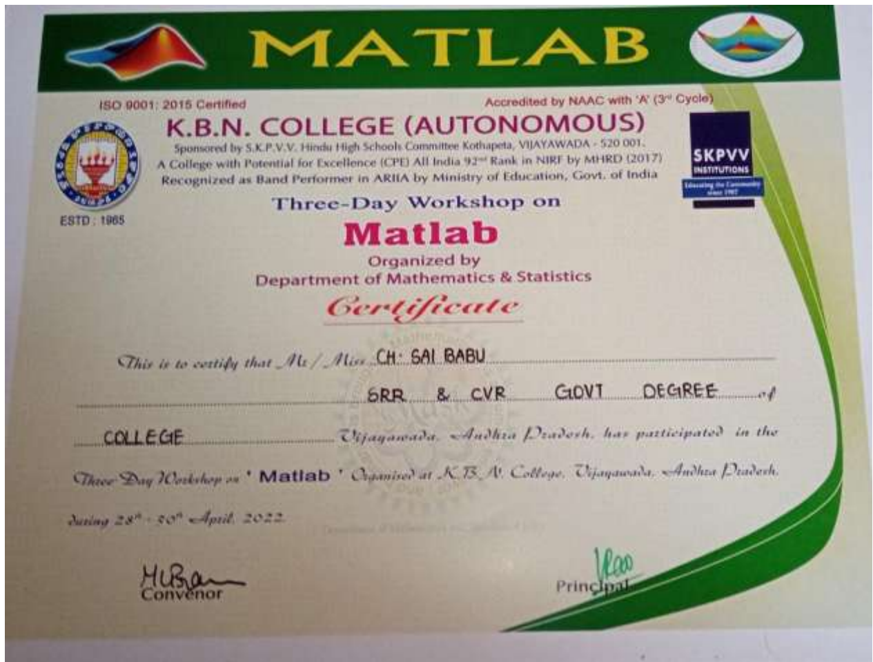
Certificates of all students