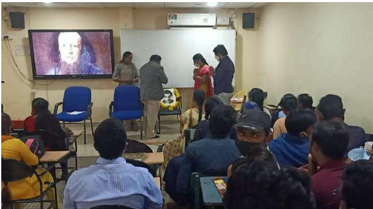
Garlanding the portrait of Sri. Srinivasa Ramanujan